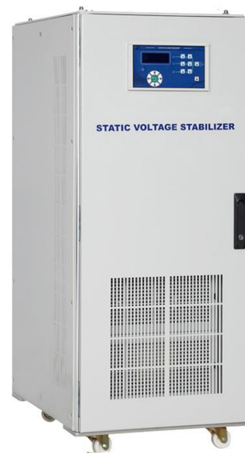
power from 60 to 300kVA