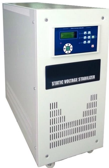
power from 10 to 45kVA

Powers from 10kVA to 500kVA Standard input voltage range: (-%25 / +15%) Intelligent voltage regulation firmware High speed voltage regulation (500V/sec.) High efficiency (>97%) Protection against overload, over temperature, high voltage, low voltage and other faults. Suitable for heavy industrial working conditions Static technology without maintenance Built against overvoltages, voltage peaks and dips/increases with independent phase regulation to correct the voltage even in the event of total load unbalance Self-test at startup Parallel connection for special high power applications LCD display for easy monitoring